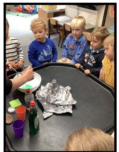
Creating a volcano!