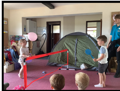
Playing balloon volleyball .