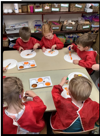
Creating Tiger faces.