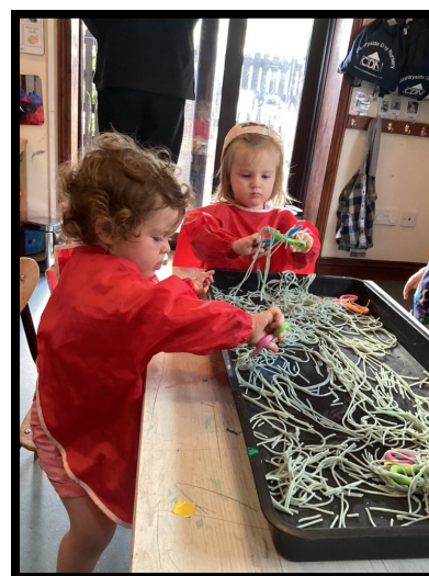
Practising our cutting skills.