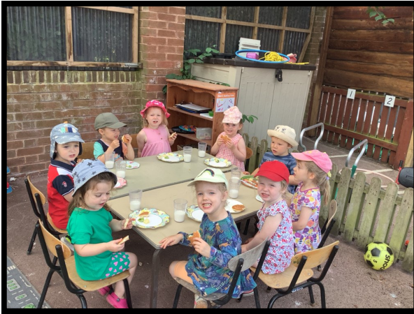
Enjoying our snack outside.