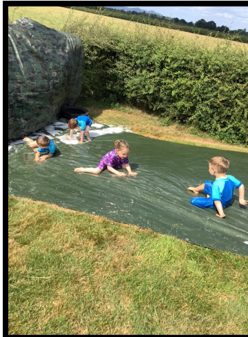
Having a splashing time on the Slip and slide.