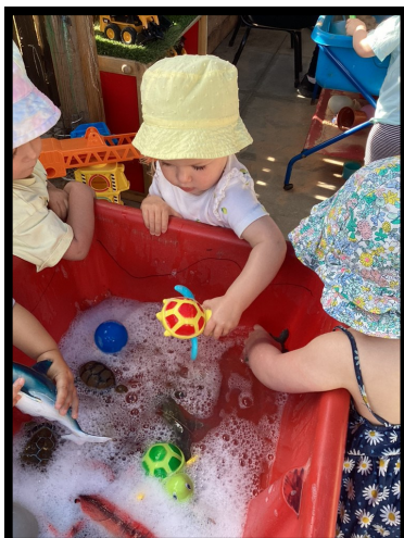
Cooling down with water play in the garden.