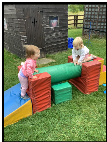
Soft play fun in the garden.