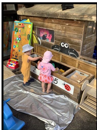
Exploring the sand tray together.