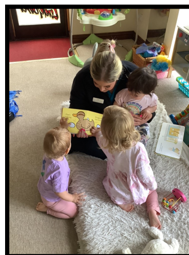
Enjoying a story together.