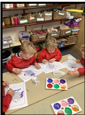
Painting our Rainbow Fish.