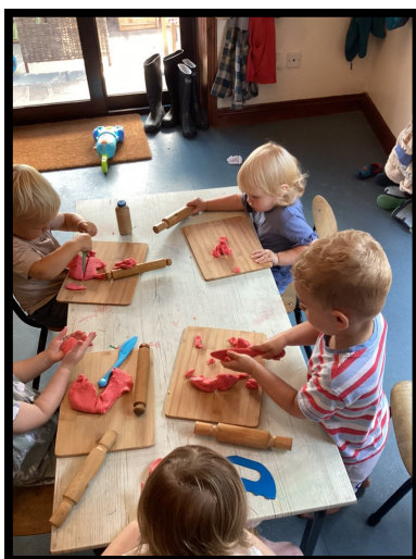
Exploring the play dough together.