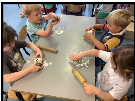
Making Gingerbread people.