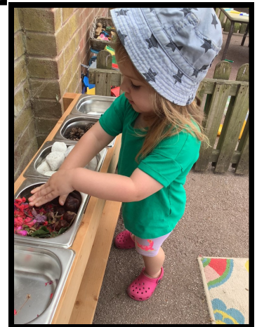
Exploring the potion station.