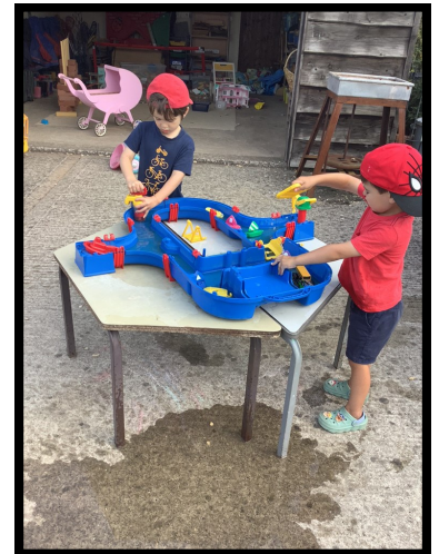
Keeping cool with the water play.