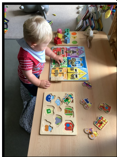
Completing some peg board puzzles.