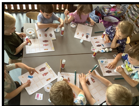
Completing a size sorting picture for Goldilocks.