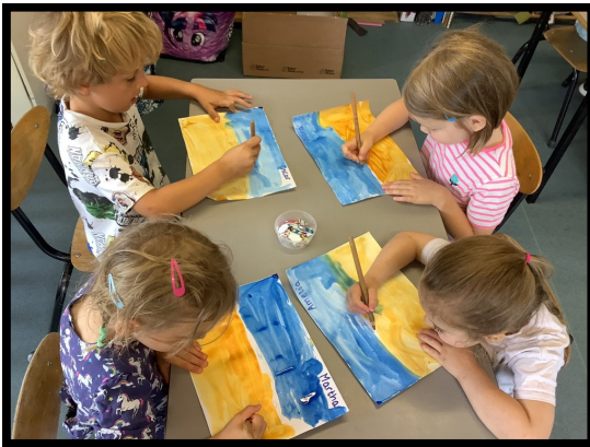
Creating our sea side pictures.