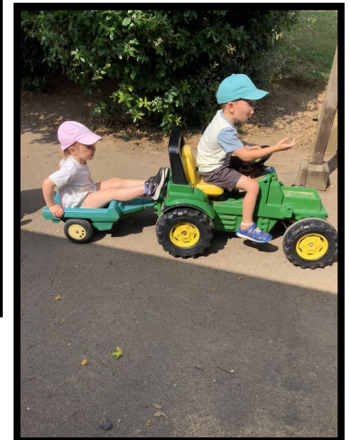
Giving my friends a ride.