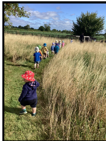
Enjoying a walk in the meadow.