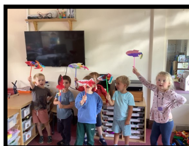
Creating our whizzy Rockets!