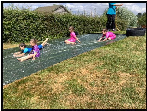
Having so much fun on the slip and slide.