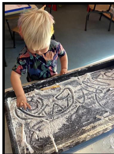
Mark Making With flour.