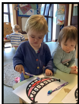
Practising cleaning teeth activity.