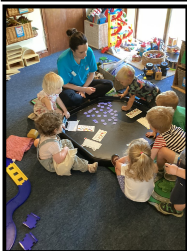
Playing the shopping game.