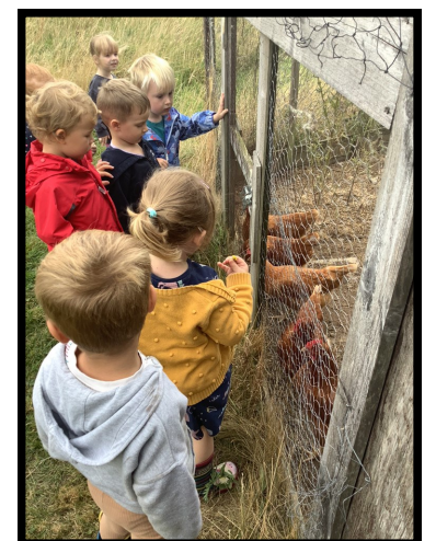
Checking the Nursery chickens.