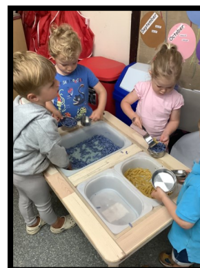
Filling and empty in the sensory tray.