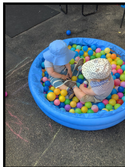
Ball pool fun in the garden.