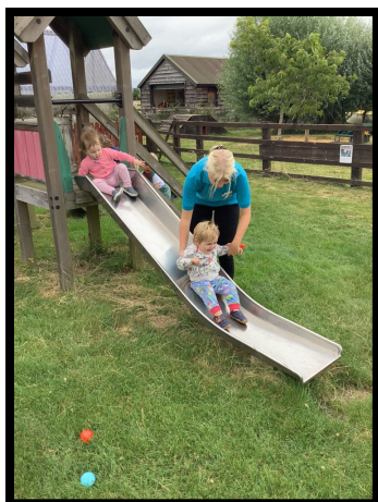
Having fun on the large slide.