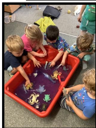
Sea life water tray fun.