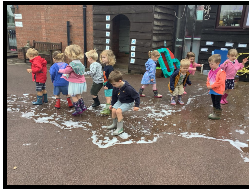
Jumping in the puddles is so much fun.