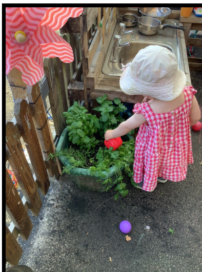
Watering the herbs.