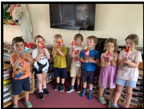
We created some Olympic torches.