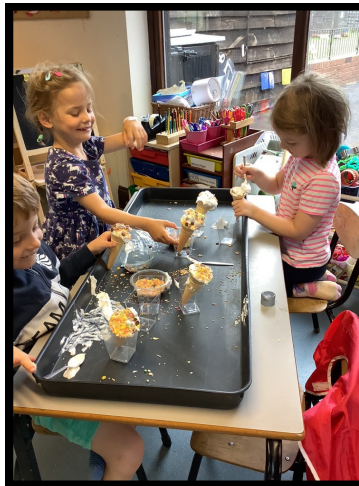
Making some ice creams in the sensory tray.