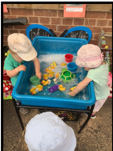
Keeping cool with water play in the garden.