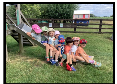
Having fun in Hedgehogs garden.